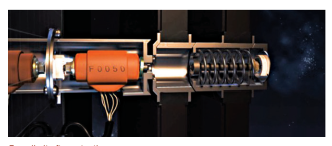
Frangibolt after actuation

ENSIGN-BICKFORD AEROSPACE & DEFENSE COMPANY 640 HOPMEADOW STREET, P.O. BOX 429, SIMSBURY, CT 06070, USA WWW.EBAD.com