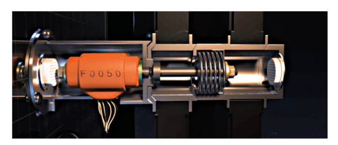
Frangibolt before actuation