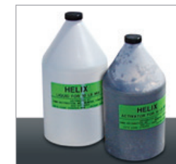
The liquid and the activator

HELIX™ is suitable for use and can be utilized in multiple end items such as shaped charges, bulk charges, disrupters and common demolition configurations.