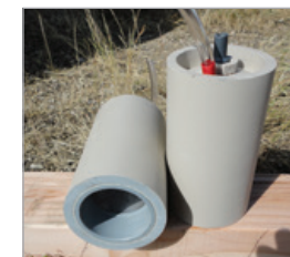
HELIX™ Explosively Formed Projectile (EFP)